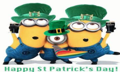
Happy St Patrick's Day!