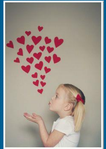
Valentine's Day Crafts

IFAPA has received special money from Chaffee Funds for teens (age 14 and older) in foster care that can only be requested through June 30, 2017. This special grant can be accessed through IFAPA's Friends of Children in Foster Care Program. These grants will be available for up to $500 per youth. This funding is for all teens (14 years and older) in a foster care placement including shelter, foster family homes, group care, & supervised apartment living. To apply for this special funding, please complete a FRIENDS APPLICATION .