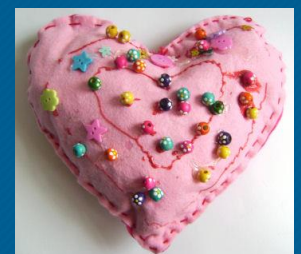
Felt Heart Pillow

This project also allows you teach sewing skills like threading a needle. February fun!